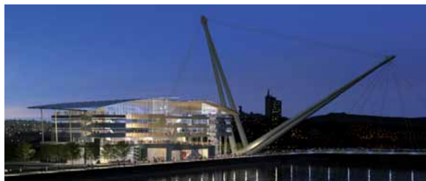
Newport's riverside University City Campus in 2010.

now in the process of setting up his own games company. According to ELSPA (Entertainment and Leisure Software Publishers Association) global sales of games and edutainment software are predicted to exceed £10 billion in 2007.