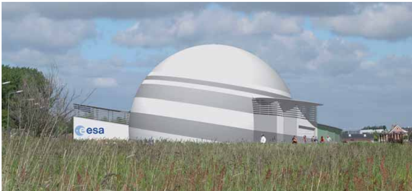
Architect's rendering of Planetary Surface Exploration Facility

The evolution from a local building engineering group based in Cardiff to a global practice operating out of Cardiff has been quite staggering. We have developed a fantastic working environment giving our dynamic, multicultural and youthful team the opportunity to map their futures and realise their personal ambitions. Whether working locally with signature architects and blue chip clients or to globe trot to the far reaches of the planet our building engineering team based here in Cardiff is taking engineering design far beyond the borders of Wales.