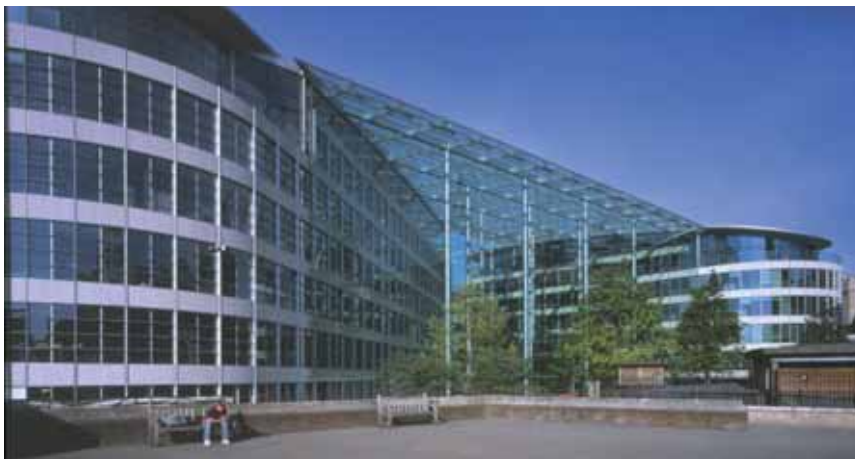
Tower Place, London

Approximately ten years ago we decided actively to develop our business beyond the borders of Wales. This took our engineers from working predominantly in the local market of Wales and the West to some remarkable projects in the City of London and far beyond.