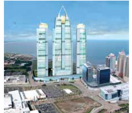
Architects rendering of Los Faros de Panama

Our high profile London work started in 1998 with the development of a project called Tower Place, immediately adjacent to the Tower of London for the global business developers Tishman Speyer Properties, with Foster and Partners as architects. This 750,000sq ft commercial development introduced us to a signature London architect and with the successful completion of this project established the Cardiff team on the London market. Other London projects quickly followed, including work for Land Securities at Cardinal Place in Victoria and a state of the art business park at Hemel Hempstead for Stanhope Properties. Perhaps one of the most adventurous and challenging of projects was the total transformation of Unilever House on the banks of the Thames, global headquarters for Unilever plc with its 5 suspended breakout spaces and meeting rooms, known as 'flying carpets', suspended by a network of high strength steel rods from the roof linked by glazed walkways to the surrounding office floors.